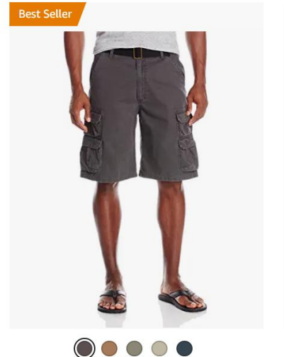
Wrangler Authentics Men's Premium Twill Cargo Short ★★★☆ × 8,465